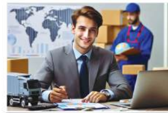
Global Business Management