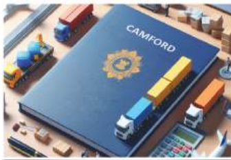
Supply Chain Management